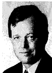
Mr M Richardson MP