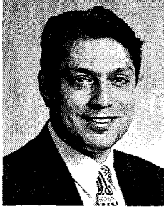
The Hon J Hatzistergos MLC Chairperson